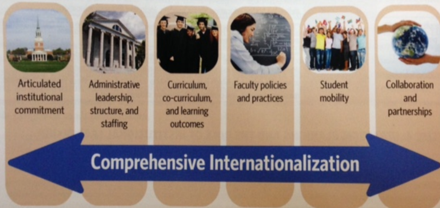
Figure 1: CIGE Model for Comprehensive Internationalization